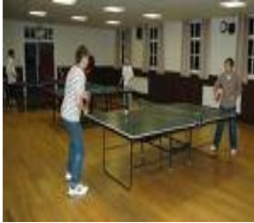
Table Tennis Club/Team